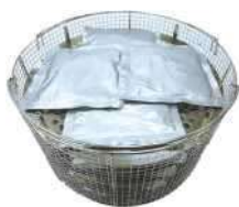
Non-stand-up pouch (Horizontal placement) (180mmx140mmx20mm) 20 pcs./basket Total 60 pcs./operation