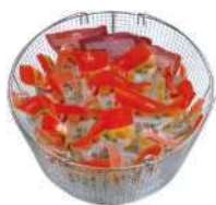
Stand-up pouch (180mmx140mmx30mm) 20 pcs./ basket Total 60 pcs./operation