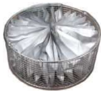
Non-stand-up pouch (Vertical placement) (180mmx140mmx20mm) 32 pcs./basket Total 96 pcs./operation