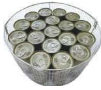
Steel can (Ø75mmx110) 18 pcs./basket Total 54 pcs./operation