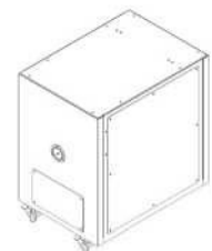
Water pumping unit