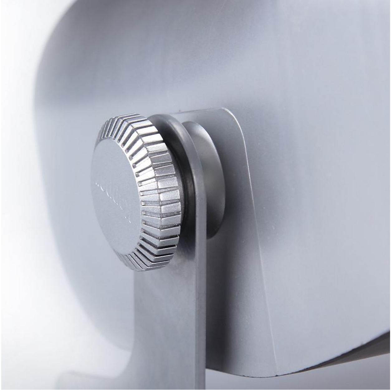
Cross flow ionizing air blower static remover with hot and cold air by remote control