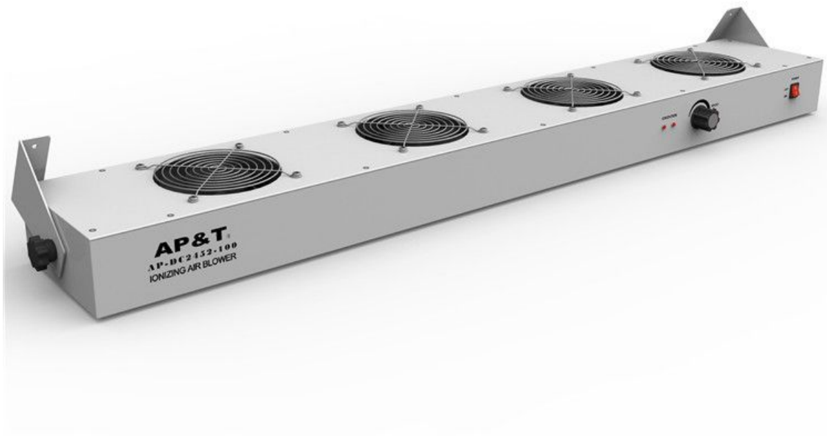
Four Fan Overhead Static Remover Ionizing Air Blower High Pressure Blower