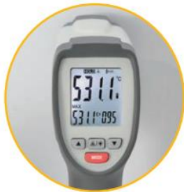
Triple LCD display with white backlight