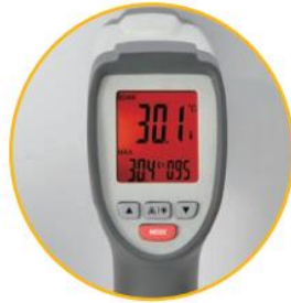
Red backlight alerts