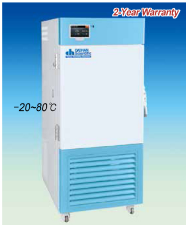
SMART Temp./Humidity Chamber "ThermoStable™ STH-E"