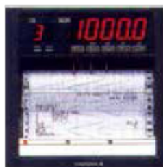
Optional ; (2) Temp. & Humidity Recorder 6 Channel 2 Pens (WTH5100)