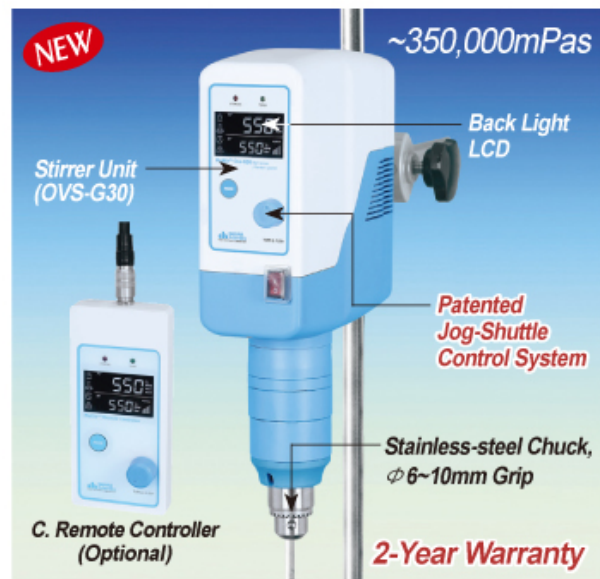
A. Max. 100Lit (H 2 O) PREMIUM Ultra "OVS-G30" Unit Only

Max. 550rpm, 350,000mPas, 프리미엄 초고점도용 교반기, 고사양 BLDC-motor, 토크 · 점도 · 온도 표시기능