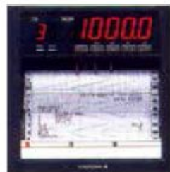
Optional ; (2) Temp. & Humidity Recorder