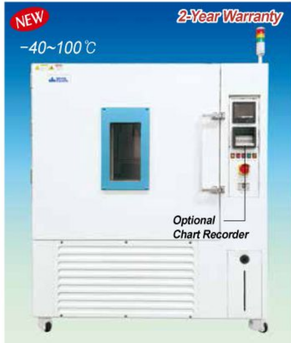
Precise Temp / Humidity Chamber "THC-800"

With Full Touch Screen Controller, Auto Supplement Water Tank, Viewing Window, Cable Port, 정밀 항온습습기