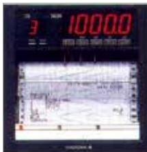
Optional ; (2) Temp. & Humidity Recorder