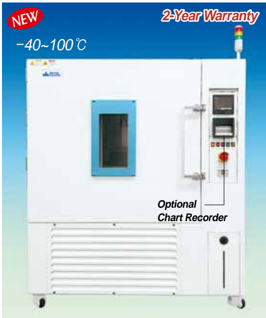
Precise Temp / Humidity Chamber “THC-800”

DAIHAN® -40~100°C Precise Temp/Humidity Chamber “THC”, 30~98% RH, 155 · 400 · 800 Lit NEW With Full Touch Screen Controller, Auto Supplement Water Tank, Viewing Window, Cable Port, 정밀 항온항습기