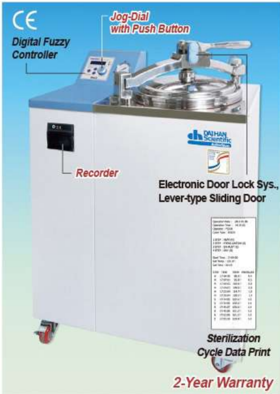
Built in Recorder-type, "MaXterile™ 80R" (1) With PED Certi. 3mm Thick-Tank (2) Without PED Certi. 2mm Thick-Tank