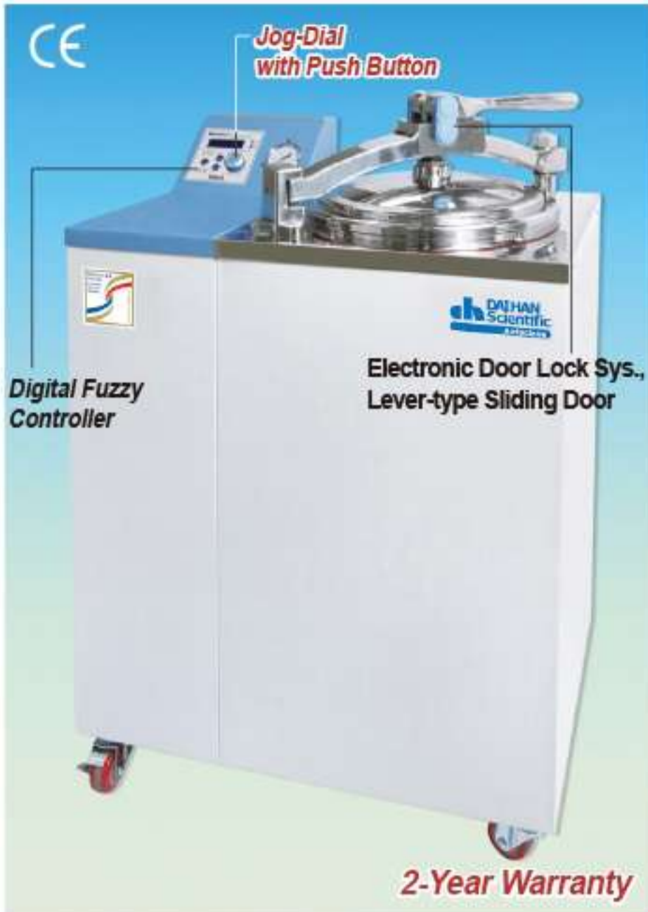
Standard-type, "MaXterile™ 80" (1) With PED Certi. 3mm Thick-Tank (2) Without PED Certi. 2mm Thick-Tank

DAIHAN-brand® Digital Fuzzy-control Autoclaves, "MaXterile™", Standard-/Recorder-type, 47-/60-/80-/100-Lit. with Electronic Door Lock Sys, Lever-type Sliding Door, Steam Condensing, Solid-/Liquid-Modes, Max.2 kgf/cm 2 , up to 132 °C (1) NEW PED Certified-model(φ 3.0mm Thick-Tank), (2) Non-PED-model(φ 2.0mm Thick-Tank)