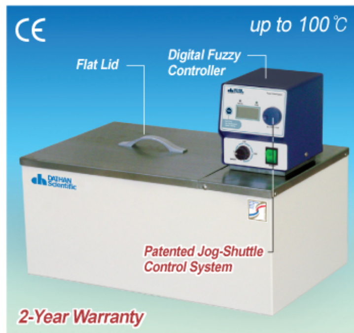
Digital Precise Circulation Water Bath Max. 22Lit, “WCB-22”

With Stainless-steel Flat Lid, Powerful Circulation Pump, up to 100°C, ±0.1°C, 5 Lit/min, 정밀 항온 순환 수조