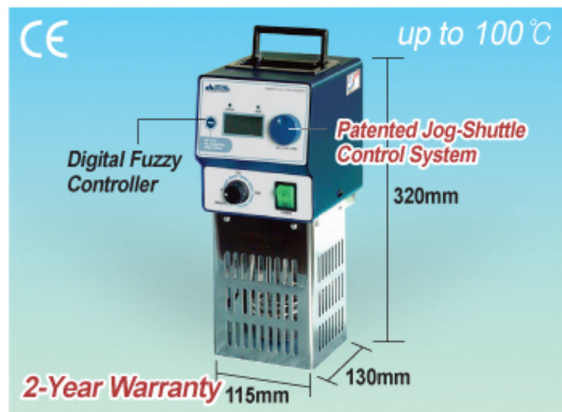
11 & 22Lit, Immersion Circulator Head “WCB-H”

With Digital Fuzzy Control System, Certi. & Traceability, Power Circulation Pump, 5 Lit/min, 정밀 항온 순환기