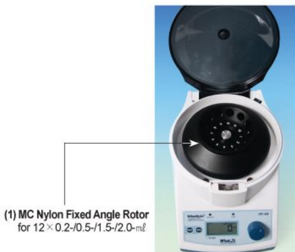
(1) MC Nylon Fixed Angle Rotor for 12 × 0.2-/0.5-/1.5-/2.0-ml

* Other Specifications are available upon Customer's Request.