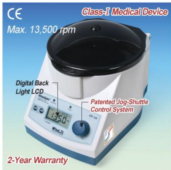
"CF-10" for 12 Tubes of 0.2 ~ 2.0ml with MC Nylon Fixed Angle Rotor