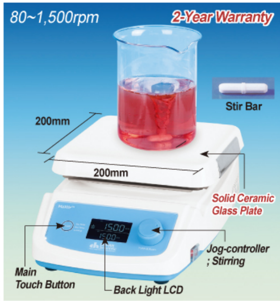
Premium Digital Magnetic Stirrer "MaXtir™ MS500"

DAIHAN® Premium Magnetic Stirrer "MaXtir™ MS500", Shade Motor, Max. 80~1,500 rpm, Max 20Lit With Large LCD, Solid Ceramic Glass Plate, 200×200mm, Touch-button Controller, Digital Feedback Control, Precise Speed Control 고성능 디지털 자력 교반기, 디지털 피드백 제어, 초강력 쉐이드 모터