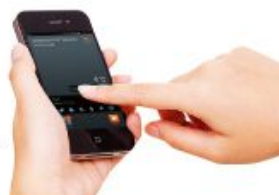
WiRe™ App Service

It is possible to monitor and control the Smart-Lab™ equipment through all smart phone, tablet without restraint of time and place.