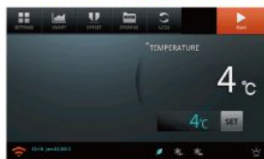
7" Full Touch Screen TFT LCD (Smart-Lab™ Controller)

It is possible to monitor and control the Smart-Lab™ equipment through all smart phone, tablet without restraint of time and place.