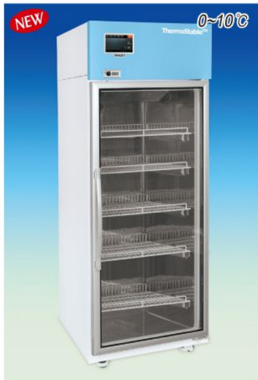
(1) 600Lit Laboratory Refrigerator "Ref600-L" with Wire-type Shelf