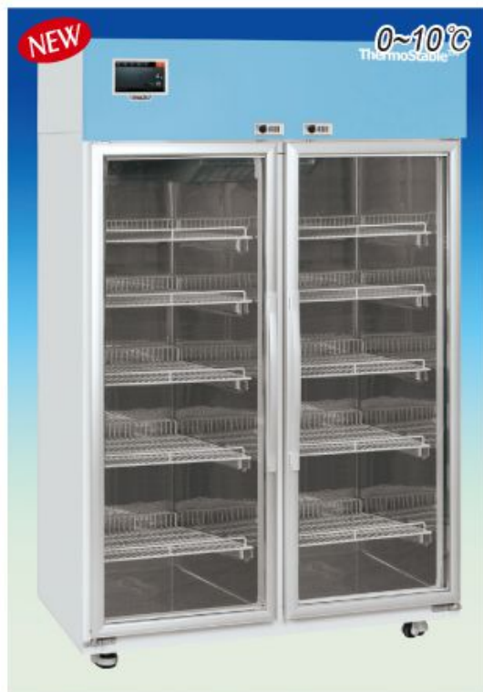
(2) 1300Lit Laboratory Refrigerator "Ref1300-L" with Wire-type Shelf