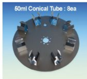
(1) Disk "WRT100"