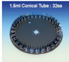
(3) Disk "WRT120"