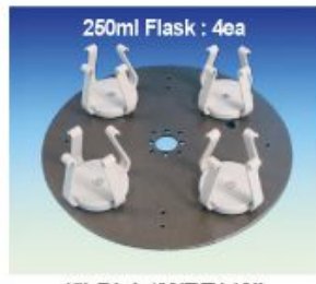
(5) Disk "WRT140"