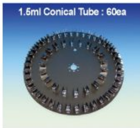
(4) Disk "WRT130"