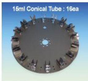
(2) Disk "WRT110"