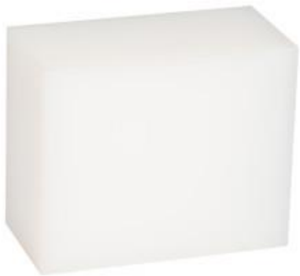
MCPC Sample Cup $52.00