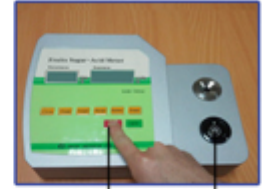
MEAS.Button Sample Well