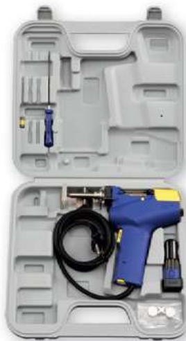
Provided in a carrying case