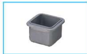
Specially coated solder pot