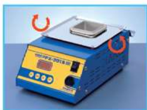
Loosen the screw on both sides.