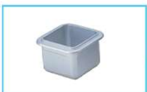
Standard solder pot

The special coating prevents the solder pot from corroding, which ensures that the solder pot has a long service life.