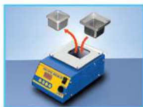
Change the pot and tighten the screws.

* For your safety, be sure to replace the pot after the solder completely cools.