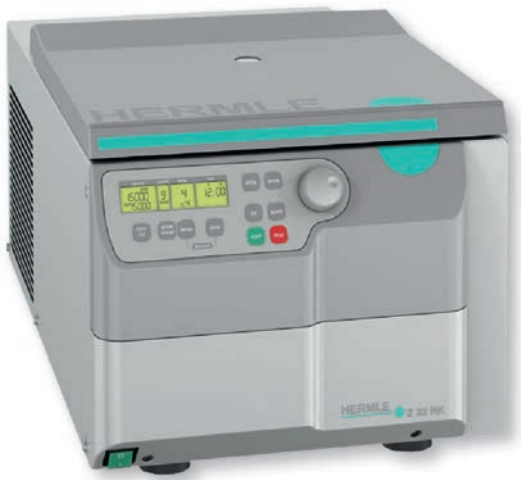
Refrigerated High Sped Centrifuge Z 32 HK

Max. speed 20,000 rpm Max. volume 4 x 145 ml