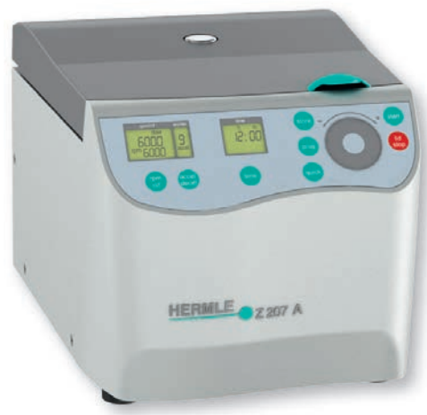
Compact Centrifuge Z 207 A

Max. speed 20,000 rpm Max. volume 4 x 145 ml