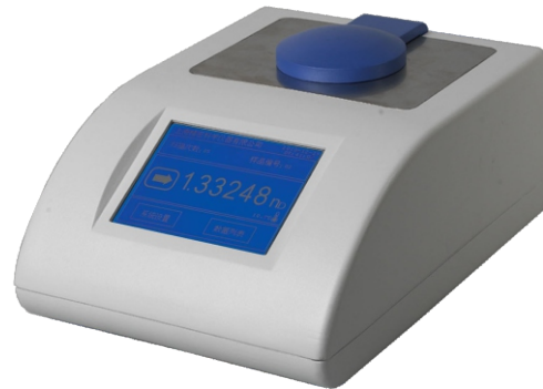
WYA-Z/ZT Automatic ABBE Refractometer