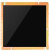
WLP (WAFER LEVEL) PACKAGE

InfiRay® Designed for the most demanding environments, 17µm detector offers high sensitivity, high reliability and various packaging types for long range detection applications.