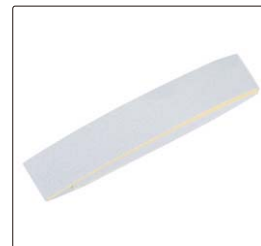
reflection sticker (included)