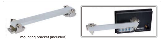
mounting bracket (included)