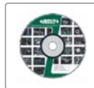
software CD (included)