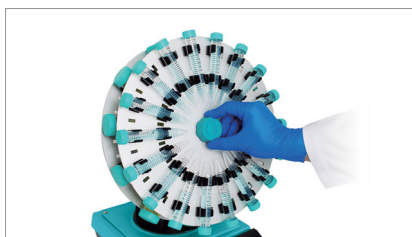
Quick installable and removable disk (optional)