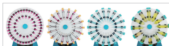
Tube holder set with disk (1.5ml / 5ml / 15ml / 50ml)