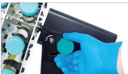
Fully adjustable angle