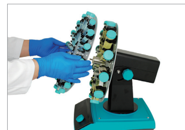
Max. mountable tubes when double stacking

※ Disk, holders, tubes, flasks in above picture are all optional.