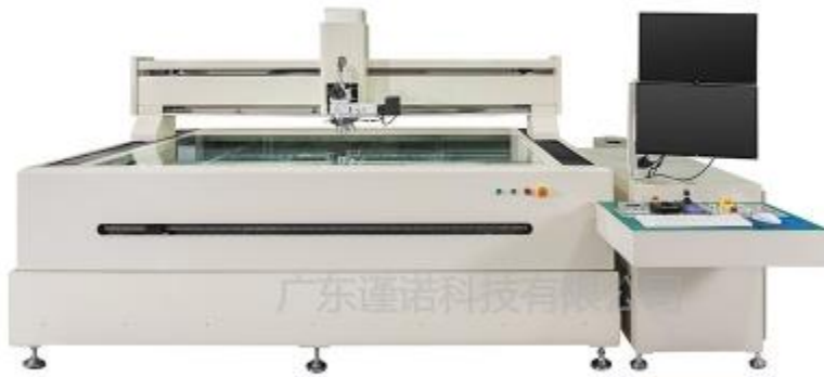
Automatic tool metallographic measuring instrument V2000