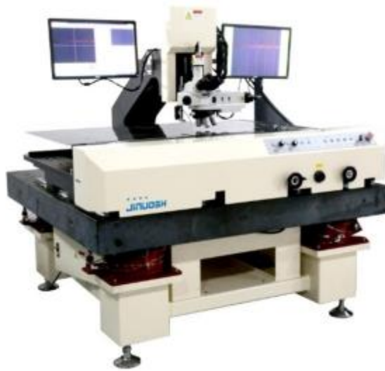
Automatic tool metallographic measuring instrument V400