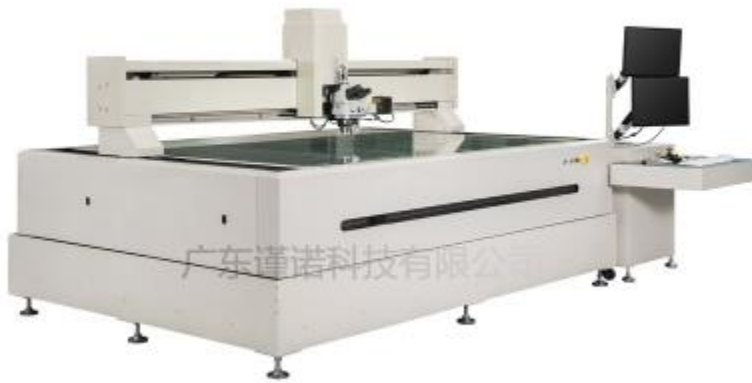
Automatic tool metallographic measuring instrument V800