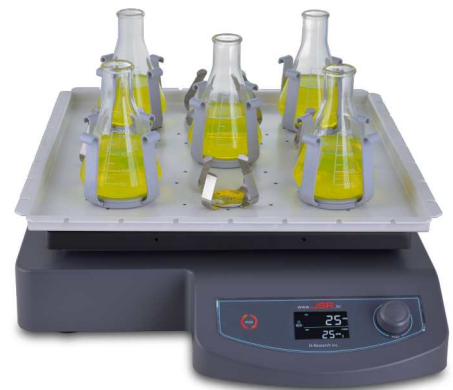
PHF-P35 Universal Flask Holder Platform