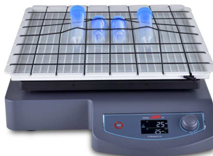
PHF-P35SET Universal Platform SET