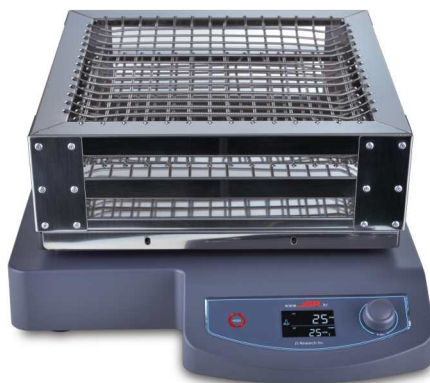
PHF-U35 Universal Spring Rack