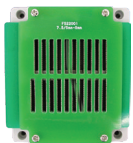
Customized fixture head