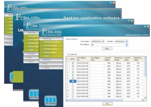
Sample Software Template

Trending of data can reveal vital information about deterioration, the enables user to take informed decision regarding maintenance.