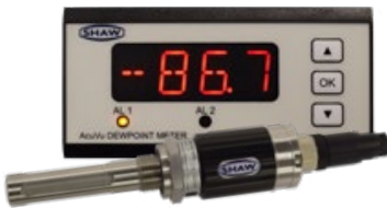
* AcuDew Dewpoint Transmitter sold separately

Various dewpoint ranges are available covering an overall range from -120 °C to +20 °C dewpoint (-184 °F to +68 °F). The 4-digit, 14 segment LED display can be factory configured to display in °C dewpoint, °F dewpoint, ppm(v), ppb(v), g/m 3 and lb/MMSCF.