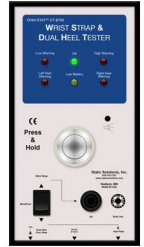
Adjustable limits. Test each foot and wrist individually and simultaneously

When used with a computer and leading edge software the employee's test results are stored in the computer and then can be emailed to supervisors. NO MORE LOG BOOKS. These reports and data can help conform your company to 20/20 specifications or ISO conformance. Speed up testing, and eliminate no tests.