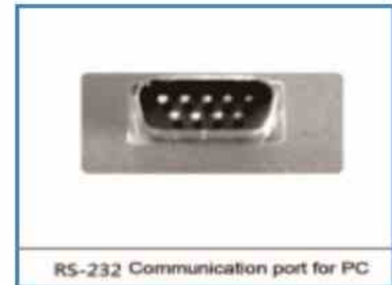
RS-232 Communication port for PC