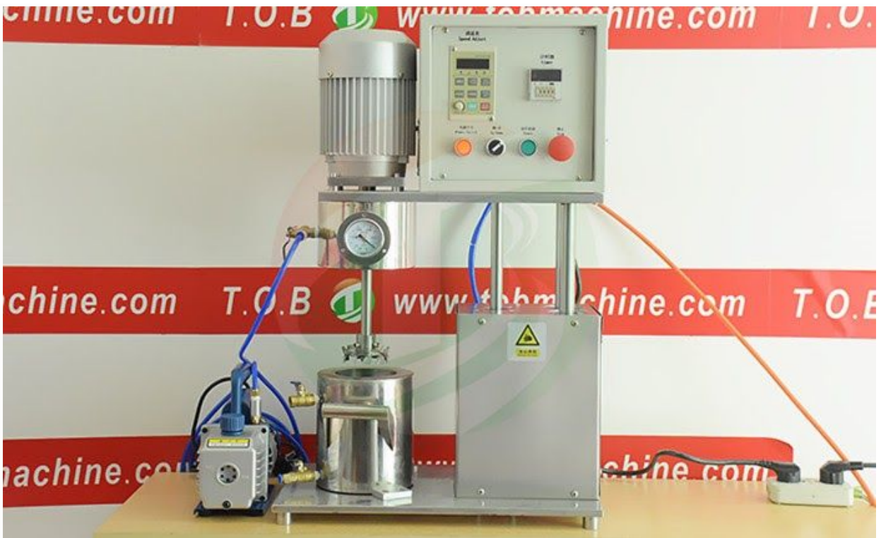
254l/min vacuum pump with the machine together