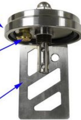
Metal filter prevent soild particals from being sucked into the vacuum pump