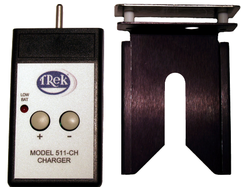
Model 511 Ionizer Kit