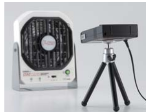
Ion balance measurement