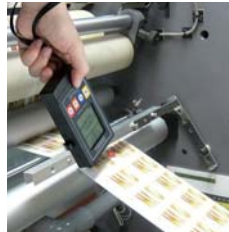
Measurement of charged potential