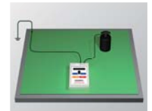
Resistance between a ground and a connecting point by a probe on a surface