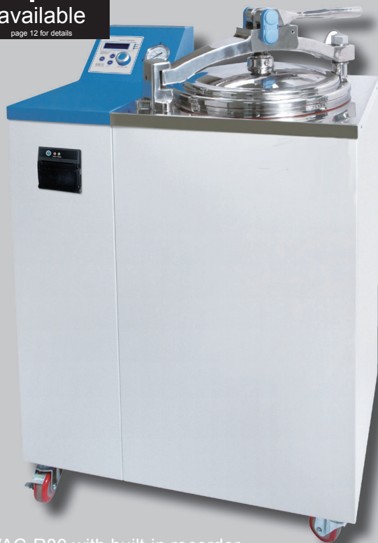
WAC-R80 with built-in recorder