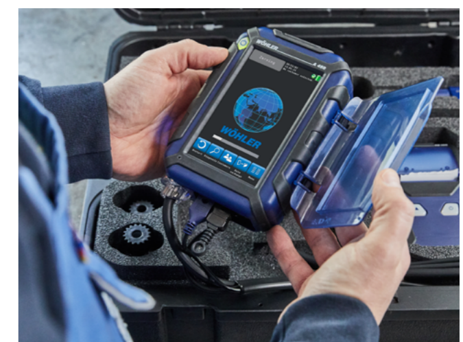
Perfect size Compact and light in a plastic case.