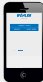
Homepage of the Wöhler A 450 App

Do you prefer to do everything with your smartphone or tablet? Then the Wöhler A 450 App is exactly the right choice for your measuring and adjustment work. No matter if you are using an Android or iOS device.