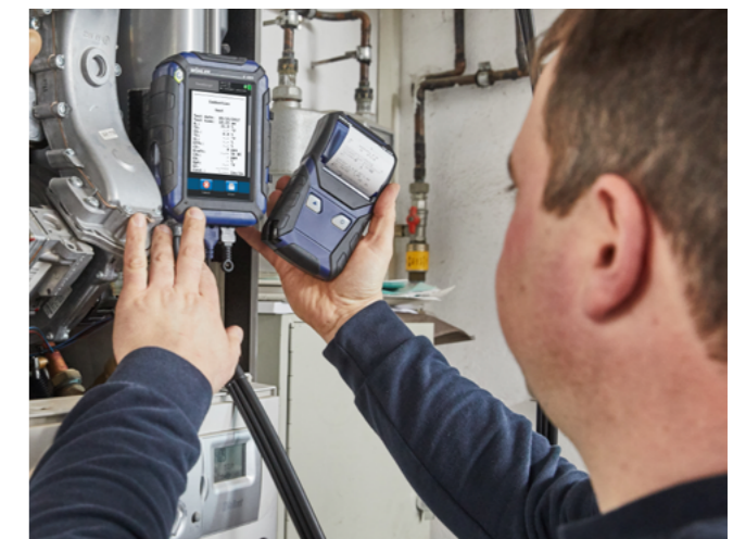
Interface to the printer Printout of the measured data on site.