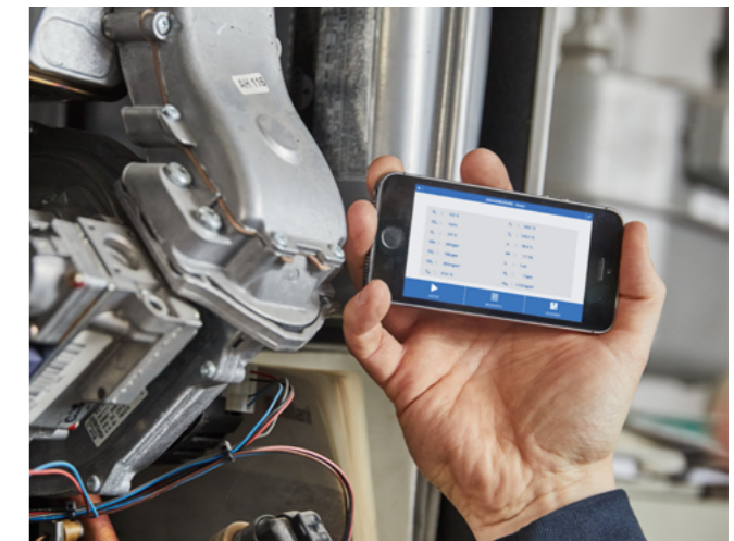
Wöhler A 450 App (Android & iOS) Displaying the measured data on a mobile device.