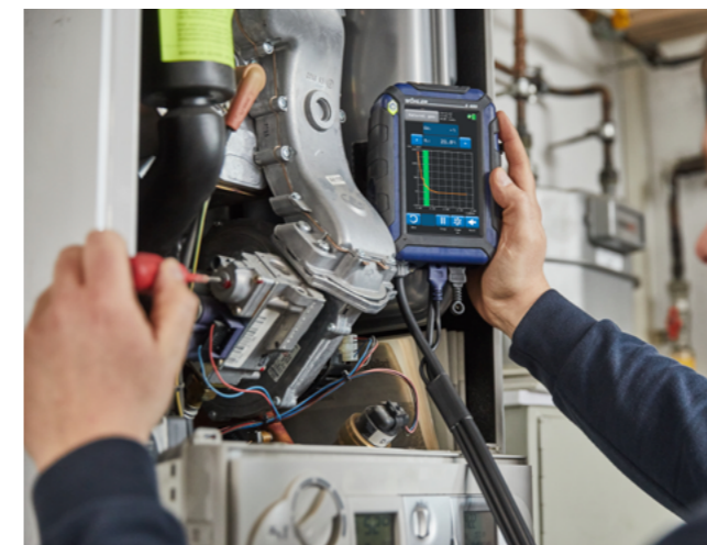
All values at a glance The tuning guide offers an advanced guidance to the technician to properly adjust the burner.