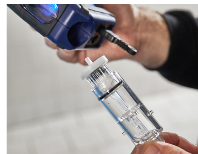
Easy maintenance Condensate trap can easily be pulled out to change cotton wool and water stop filters.