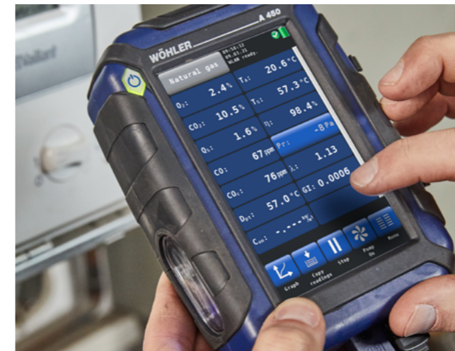
5" large color touchscreen All measured values available at a glance thanks to high-resolution display.

1) Wöhler A 450 L: 24 months; Wöhler A 450 / 450 H: 48 months; excludes thermocouples, rechargeable battery and optional NO sensor. For more information please see our Terms and Conditions.