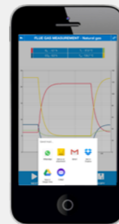
Dispatch of measurement data to the customer