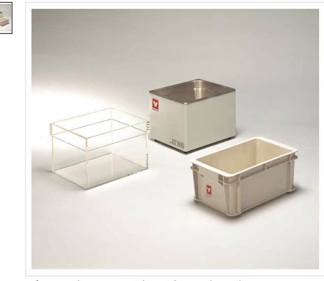
Left: BX Acrylic Top: BZ Stainless Right: BY polypropylene