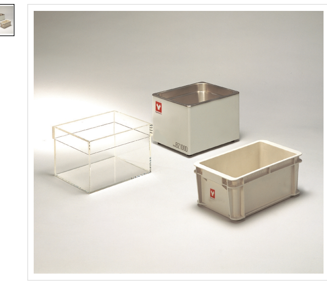
Left: BX Acrylic Top: BZ Stainless Right: BY polypropylene